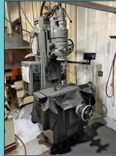
Moore Model G18 Jig Grinder