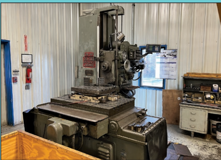
DeVlieg Model 3B-48 Jig Mill w/ DRO