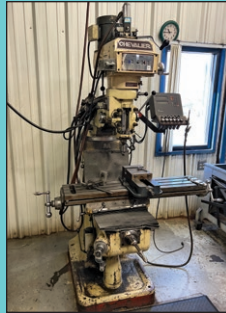
3 HP Chevalier Vertical Mill w/ DRO