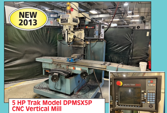
5 HP Trak Model DPMSX5P CNC Vertical Mill