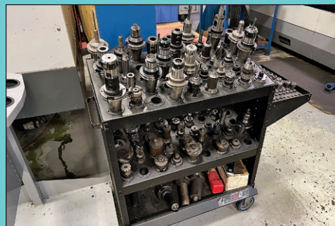
(250) 50 and 40 Taper Toolholders