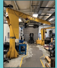
1/2 Ton x 10' Gobel Free-Standing Jib Crane w/ Chain Hoist