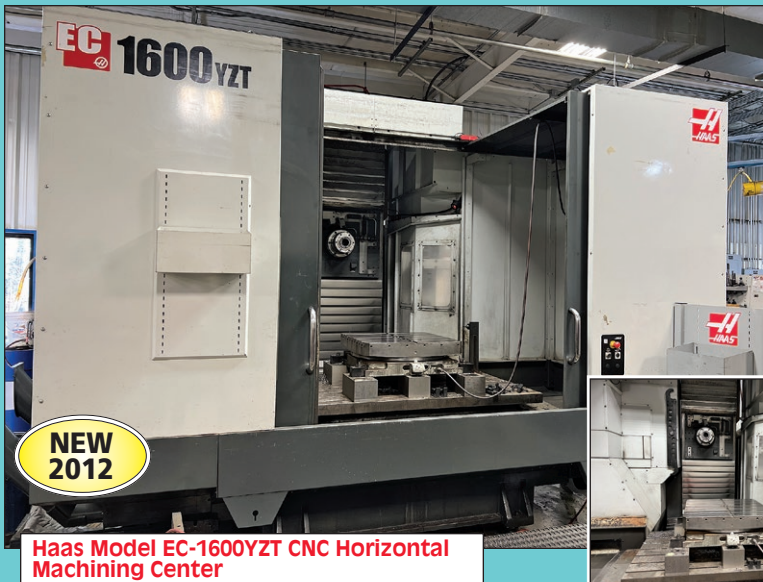
Haas Model EC-1600YZT CNC Horizontal Machining Center

INSPECTION: Wednesday, April 17th from 10:00 AM to 4:00 PM