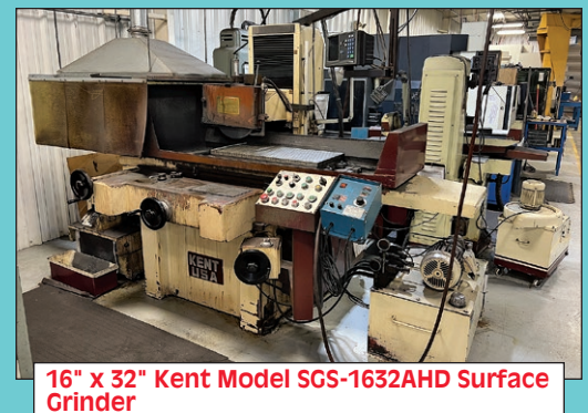
16" x 32" Kent Model SGS-1632AHD Surface Grinder