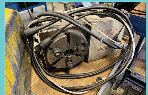
(2) 6" Haas Rotary 4th Axis