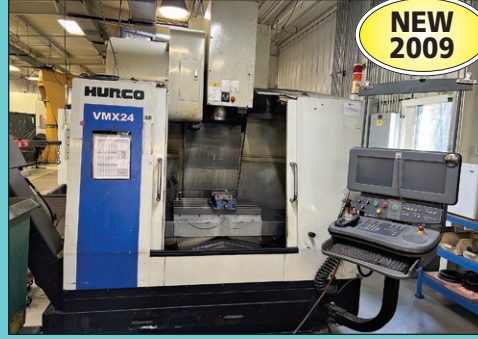
Hurco Model VMX24 CNC Vertical Machining Center