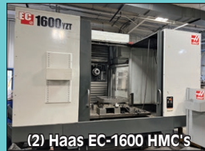
(2) Haas EC-1600 HMC's

Contact Information 2020 Dunlap St. Cincinnati, Ohio 45214 Phone 513-241-9701 Fax 513-241-6760 www.cia-auction.com