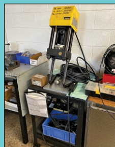
Parker Hydraulic Hose Crimper w/ Dies