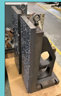
10" x 32" Angle Plates