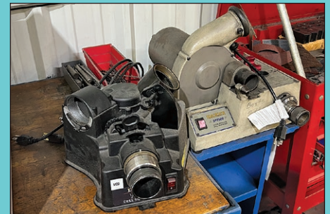
Darex Drill Sharpeners