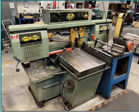
13" x 18" Hydmech Model S-20 Horizontal Band Saw