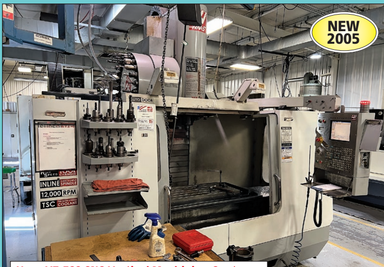
Haas VF-3SS CNC Vertical Machining Center