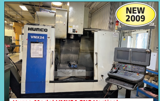
Hurco Model VMX24 CNC Vertical Machining Center