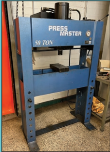
50 Ton RK Machinery Model 50T-E/H Hydraulic H-Frame Press