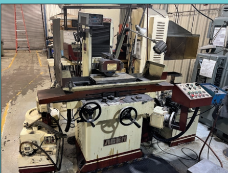
10" x 20" Kent Model AGS-1020AHD Surface Grinder