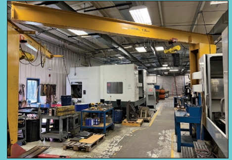
1 Ton x 18' Arm Gobel Free-Standing Jib Crane w/ Chain Hoist