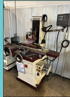
6" x 18" Chevalier Model FSG-618M Surface Grinder