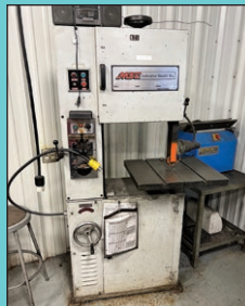
18" MSC Vertical Band Saw