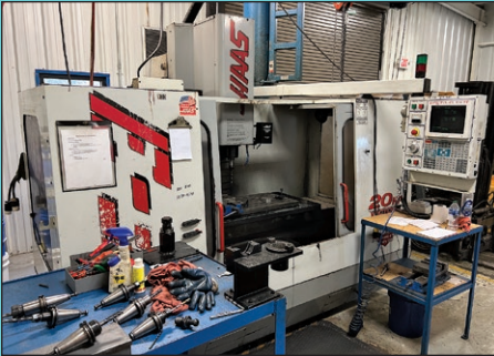
Haas VF3 CNC Vertical Machining Center