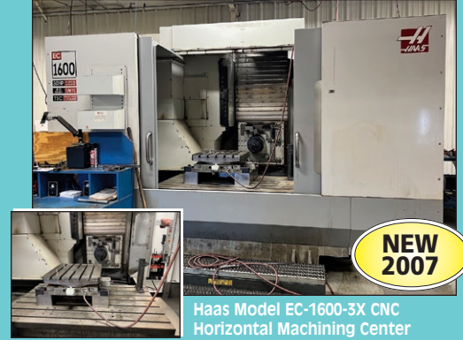
Haas Model EC-1600-3X CNC Horizontal Machining Center