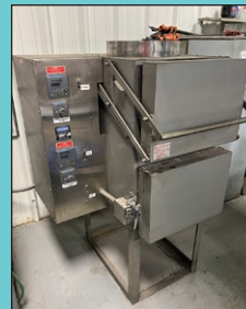
Cress Model C2121/SDHLCU+L Two-Chamber Electric Furnace