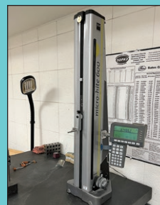
Brown & Sharpe MicroHite 600 Height Gage