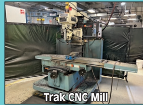
Trak CNC Mill