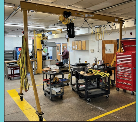
1 Ton x 12' Span Spanco Gantry Crane

Darex BVL-45 Beveling Machine Baldor DE Grinder Lectro Arc Tap Disintegrator