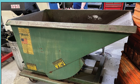
Jesco Dump Hopper