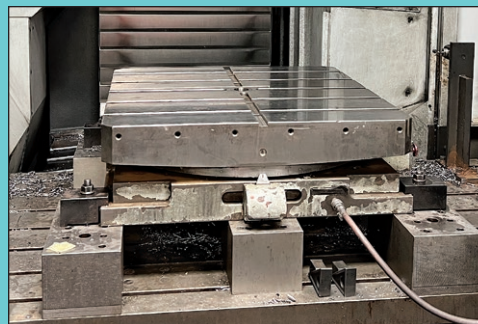
(2) 23.5" x 23.5" Air Rotary Tables