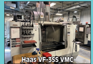
Haas VF-3SS VMC