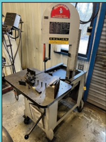
12" Roll-In-Saw Vertical Band Saw