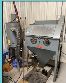
Trinco Model 36/450RC Blast Cabinet w/ Reclaim