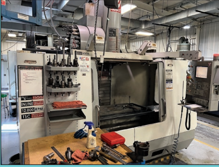
Haas VF-3SS CNC Vertical Machining Center