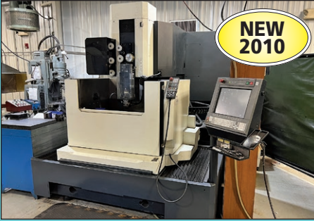
Makino Model DUO64 CNC Wire EDM **Out of Service