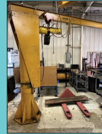
1 Ton x 10' Gobel Free-Standing Jib Crane w/ Chain Hoist