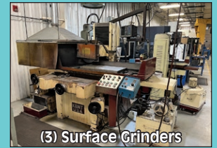
(3) Surface Grinders